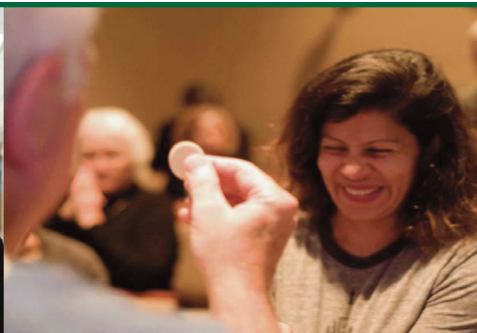
Proclaiming the Gospel