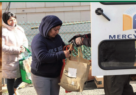
Caring for the Poor and Vulnerable