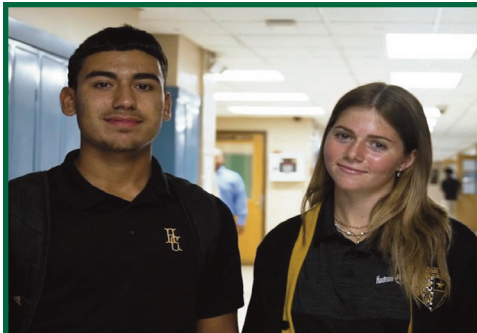
Passing on the Faith