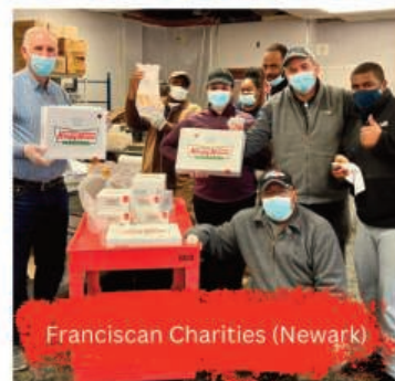
Franciscan Charities (Newark)