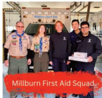
Millburn First Aid Squad