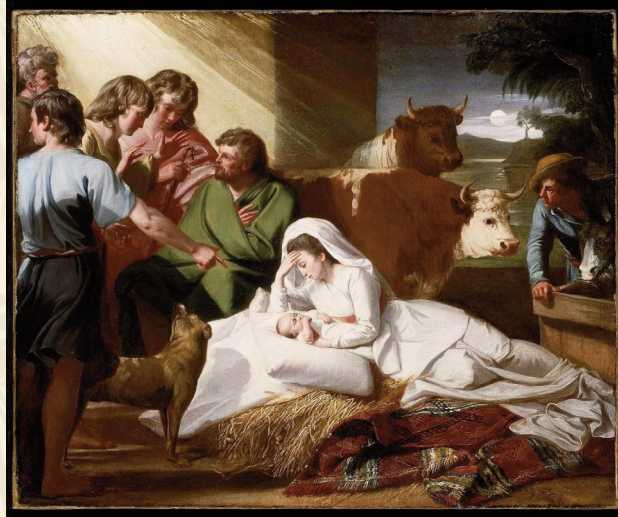
The Nativity John Singleton Copley