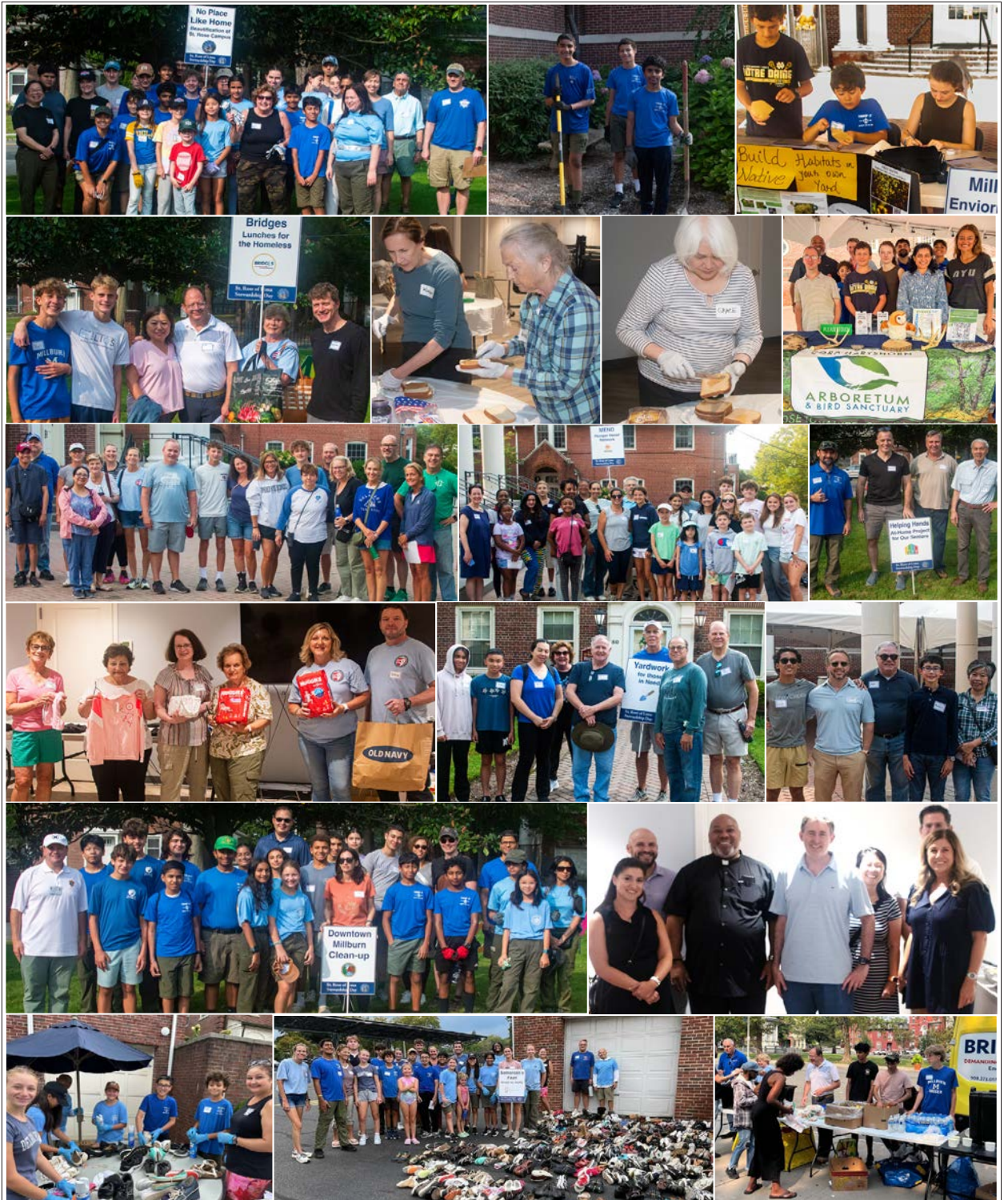
Thank you, volunteers! St. Rose of Lima Parish - Stewardship Day 2025