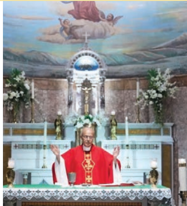
PROCLAIMING THE GOSPEL