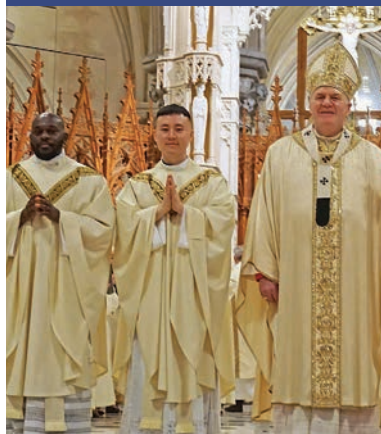
FORMING FUTURE PRIESTS AND SUPPORTING RETIRED CLERGY