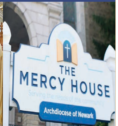
CARING FOR THE POOR AND VULNERABLE