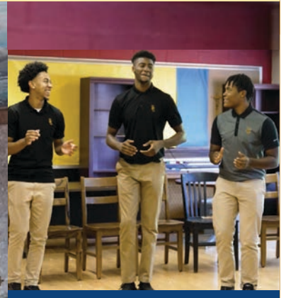
PASSING ON THE FAITH